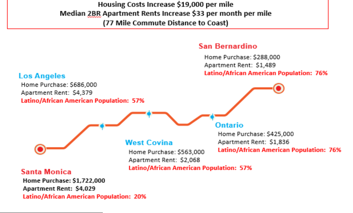
Figure 1: Geography of Southern California Region's Housing Cost Crisis

Finally, housing is more affordable - without waiting to win a lottery reserved for low income households - farther away from the Coast and Bay. That means non-affluent workers - especially essential workers who are required to be on time on the jobsite - are driving to tony coastal enclaves that neither they nor their kids have any expectation of ever being able to afford under longstanding state housing policies. As shown in Figure 1, below, even in pre-pandemic 2017: