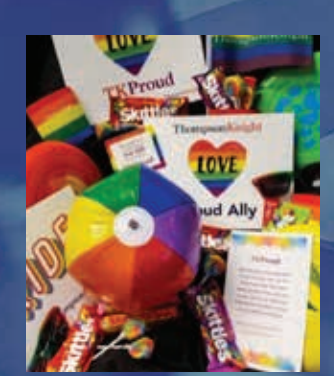
Our Firm Celebrates PRIDE 22nd Annual Hu at home with Pride Party Packs Campaign Gala