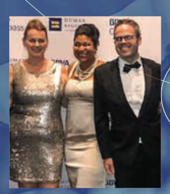
22nd Annual Human Rights Campaign Gala Marriott Marquis, Houston