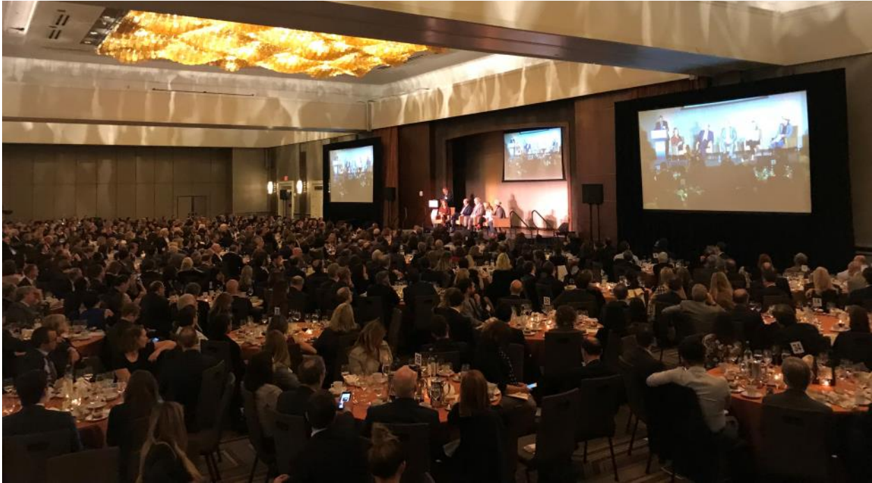
Six hundred MLRC members and friends gathered at the Grand Hyatt for the Annual Dinner